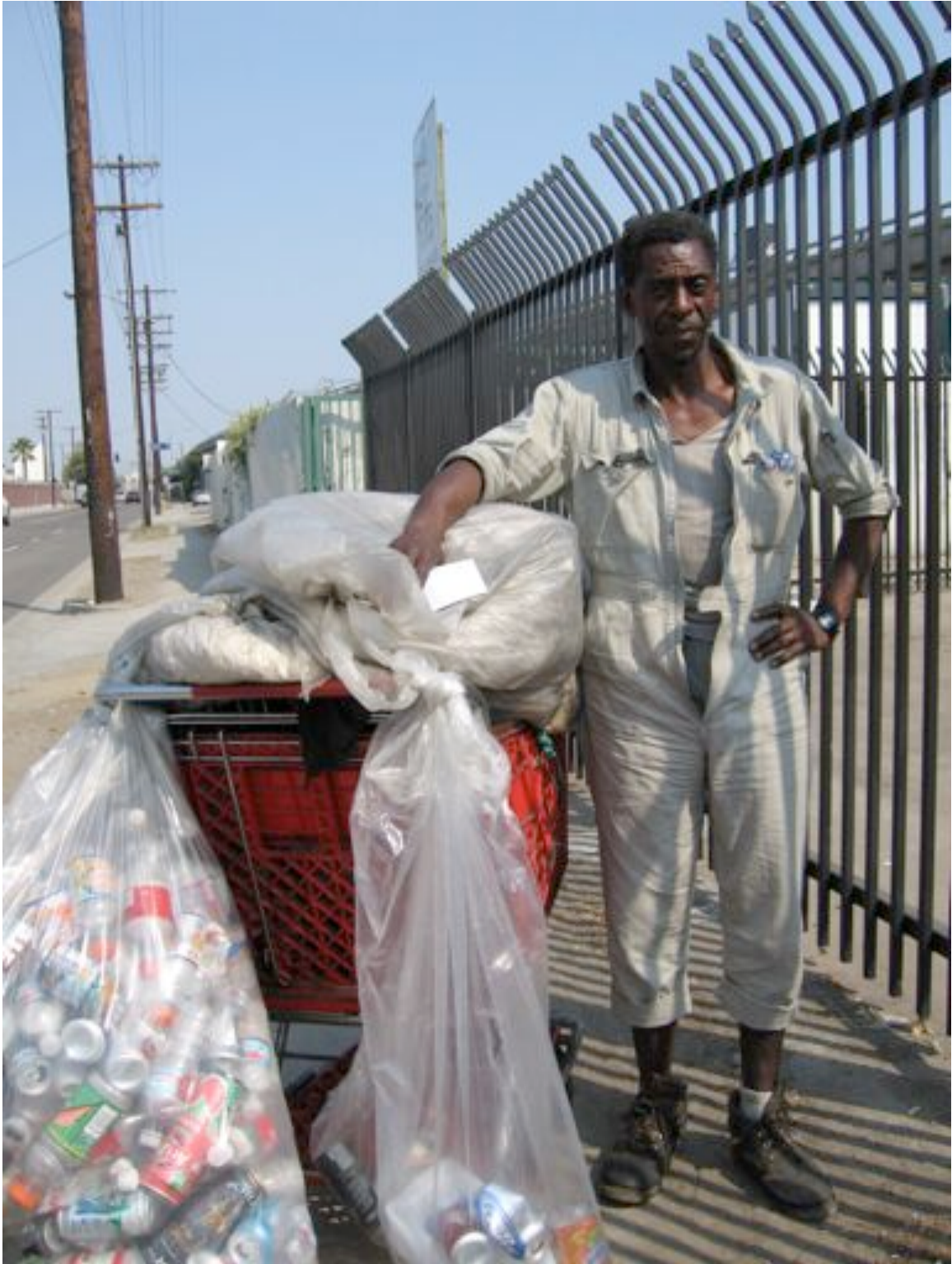
Peter (name changed per request)